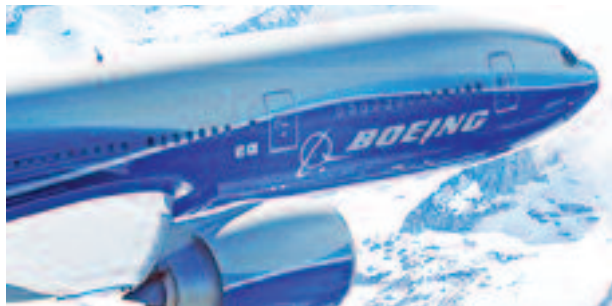
Figure 1 Composite materials are incorporated into automobiles, boats, and aircraft.