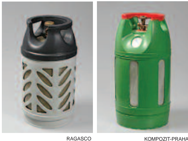
Figure 4 One-piece construction composite cylinders.

The one-piece composite cylinder is currently manufactured by two different companies: Ragasco and Kompozit-Praha. Both companies manufacturer a one-piece composite cylinder with a blow molded PET liner and HDPE jacket. 15 16 The Ragasco cylinder has a DOT special permit for use in the United States, and the Kompozit-Praha cylinder is currently in the special permit process.