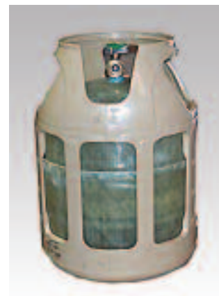
Figure 6 Two-piece construction composite cylinders.

The two-piece composite cylinder is currently manufactured by The Lite Cylinder Company as a linerless two piece (top and bottom fitted together) with an ABS jacket. 18 The two halves of each cylinder are wound with fiberglass around a mandrel and then injected with plastic resin under high pressure in a hermetic process. After hardening, the two halves are taken out of the molds and are adhesively joined together. Holes are drilled in one half and the two halves are bonded together to create the completed cylinder. A thermoplastic outer casing is attached to the cylinder to provide additional protection. 19