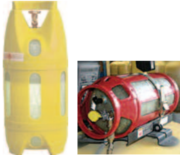
Figure 3 The most common composite cylinders are the 20 lb. BBQ and 33 lb. Fork Lift types.

ders being manufactured are the 20-pound cylinder for barbeque grills and outdoor heaters, and the 33-pound cylinder for forklifts. 9