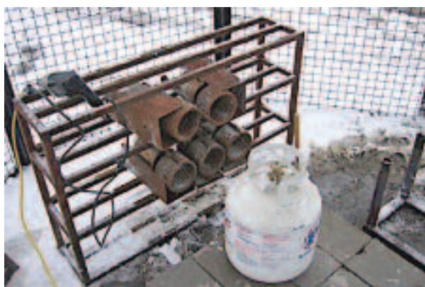
Figure 8 Preliminary fire tests conducted by Battelle.