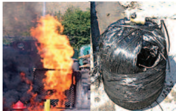
Figure 9 Burning pool fire test of two-piece composite cylinder conducted by Nassau County, NY.