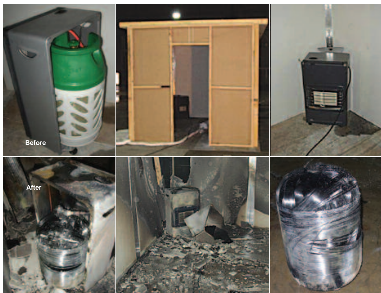
Figure 11 One-piece construction composite cylinders fire test.

300 kW fire was set in one corner of the room. The pressure inside the cylinder was measured and the cylinder was observed to determine if the composite material ignited.