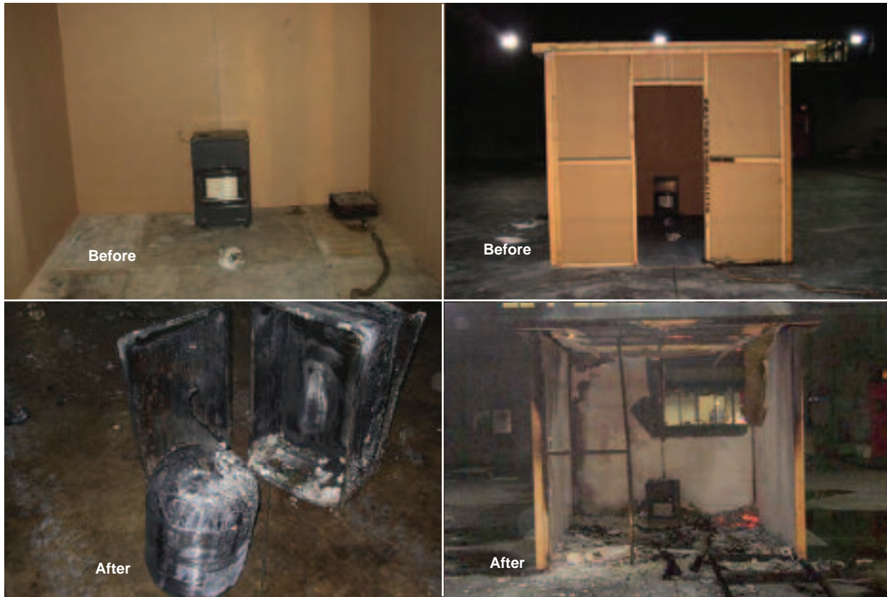
Figure 10 Cabinet heater with composite cylinder fire inside a room.