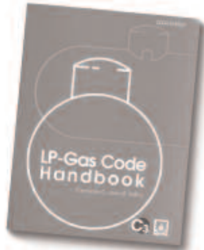
Figure 7 National LP Gas Code.

In 2005 the propane industry proposed revisions to NFPA 58 that would allow composite cylinders to be used indoors in conjunction with portable unvented cabinet heaters having a maximum output rating of 10,000 btu/hr. This proposal is scheduled for a vote by members at the NFPA's World Safety Conference, June 6-7, 2007, Boston, Massachusetts. 29